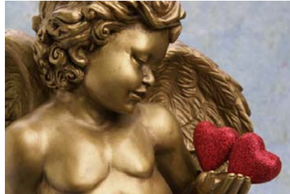
Happy Valentines Day!