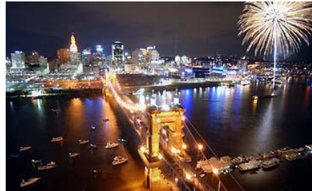
LABOR DAY IN CINCINNATI

Bring Web surfers aboard at your site with help from FrontPage 2003 For Dummies, by Asha Dornfest.